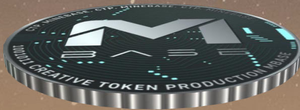
BUY LAND WITH MINEBASE TOKENS WITH A HUGE ADVANTAGE