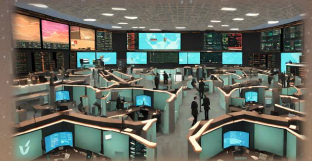
MINEBASE METAVVERSE EXCHANGE MMSE