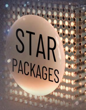
LAND SHARES IN THE STAR PACKAGE