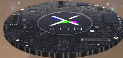
XON TOKEN THE MEANS OF PAYMENT FOR THE METAVVERSE