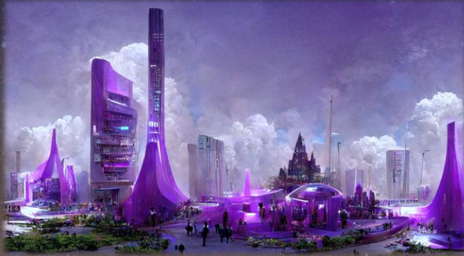
MINEBASE METAVVERSE MINESTAR CITY